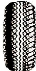
Faulty wheel alignment