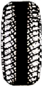
Too high air pressure