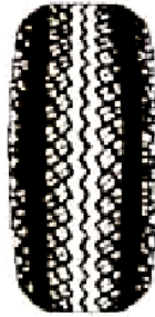
Too low air pressure